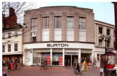
Former site of Cornhill Underground Station, Tavern Street

http://www.simonknott.co.uk/ipswichunderground.htm