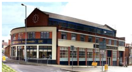
Former site of Fore Hamlet Underground Station, Duke Street (now Loch Fyne at Mortimers)

The revival of the Ipswich Underground was to occur in a quite remarkable manner. In 1933, the newly-elected Ipswich Borough Council consisted largely of Communist sympathisers, and even a few party members. One of its first acts was to send a message of support to Joseph Stalin and the Central Committee of the Communist Party of the Soviet Union. Stalin was so pleased with this kick in the face for